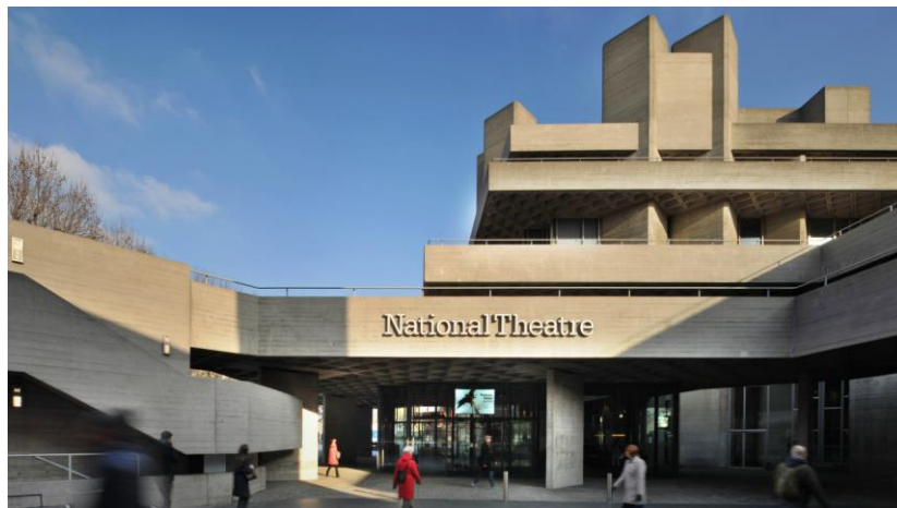
Figure 2 The National Theatre in London [20]

Regarding the key example in this paper of the building of the National Theatre, Great Britain, Fig. 2, the multifunctionality of its architecture, space, and uses—in a utilitarian sense—is illustrated. Through the creative and clever use of interior and exterior space, this example shows us how architecture, in its most essential form, can have a successful impact on public space, while increasing the quality of the entire urban environment. The interior itself includes spaces with various functions; therefore, in addition to the utility-related uses—theatre and concert halls, galleries, lounges and cafés—this building prides itself on numerous ideological or environmentally sustainable functions.