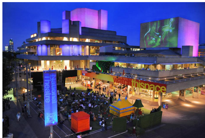
Figure 4 “Watch This Space” - outdoor events at the National Theatre in London [23]

A great example of a successful and very popular event that continually expands the ideological functions of the National Theatre, is a project called Watch This Space, a quarterly festival of street theater, cabaret, music, and film screenings that takes over the South Bank of the River Thames, primarily in and around the National Theatre. This unique artistic initiative brings together a large number of contemporary artists, who create works live in the external space, under the watchful eye—or at times active participation—of the public. Doing so gives this space and structure new functions, such as cultural, theatrical, poetic, dramaturgical, emotional, inclusive, artistic, promotional, or economic functions.