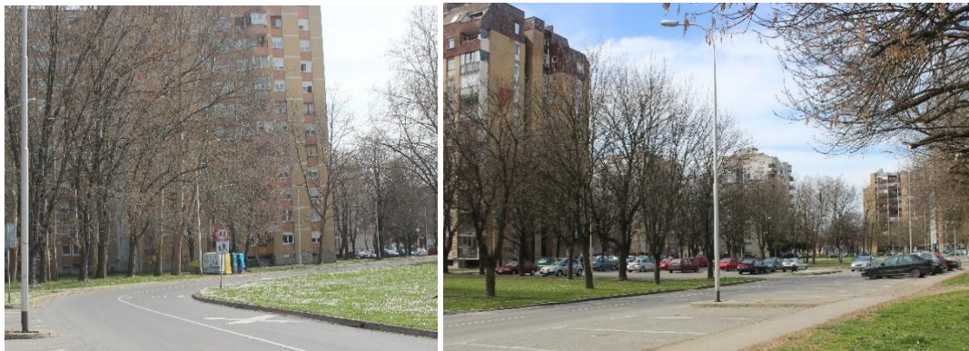
Figure 6 The settlement of Sjenjak