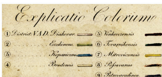
Figure 3 Colour legend on the Map of the Bosnia or Đakovo and Symria Diocese [3]