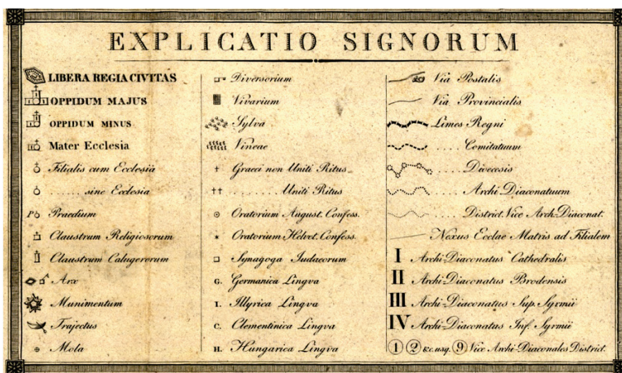
Figure 2 Legend on the Map of the Bosnia or Đakovo and Symria Diocese [3]