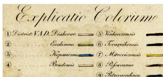
Figure 3 Colour legend on the Map of the Bosnia or Đakovo and Symria Diocese [3]