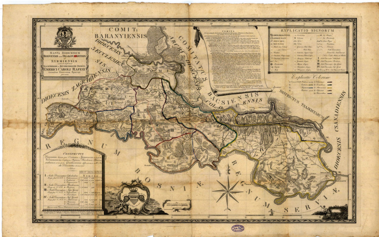
Figure 1 Scaled-down Map of the Bosnia or Đakovo and Syrmia Diocese [3]

The legend and the colour legend are placed in the upper right part of the map sheet. After printing the map was additionally coloured by hand in order of better noticing the existing deaneries (in Fig. 2 and Fig. 3, in Tab. 1 and Tab. 2). The applied symbols both for the ecclesial and the secular objects are replicative symbols [4].