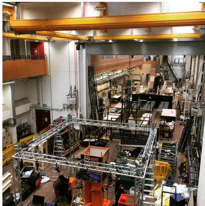
Figure 3 Free Access to Sherling Backstage Walkway [21]

On the elongated terraces that are used as a pedestrian link for outdoor movement on the mezzanines, a pop-up outdoor bar has been created with a fantastic view of this historic part of London. “The strata of the building are like new levels of ground and they will become real places. It is very important that the National Theatre becomes a part of the city. Any idea of a cultural ghetto has gone,” said Lasdun [22]. These new levels of the ground create an outdoor space whose features have the traits of the cloister type of form, and is used as a unique space for various themed public and private functions. Lasdun’s strata make it hard to define where the National Theatre begins and ends. The interconnected walkways, split levels, and circular stairwells of the South Bank merge with the city itself.