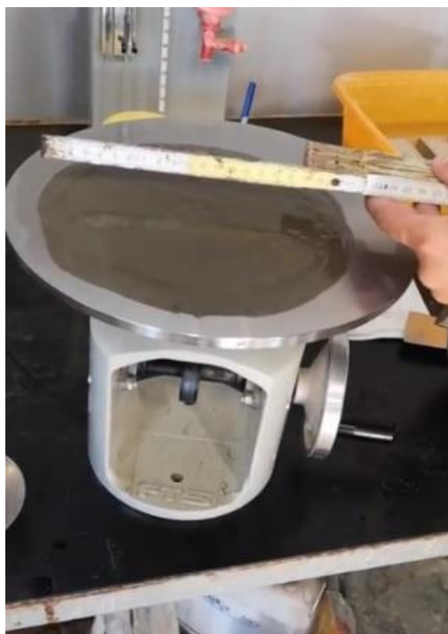
Figure 2. Testing the mortar consistence by flow table