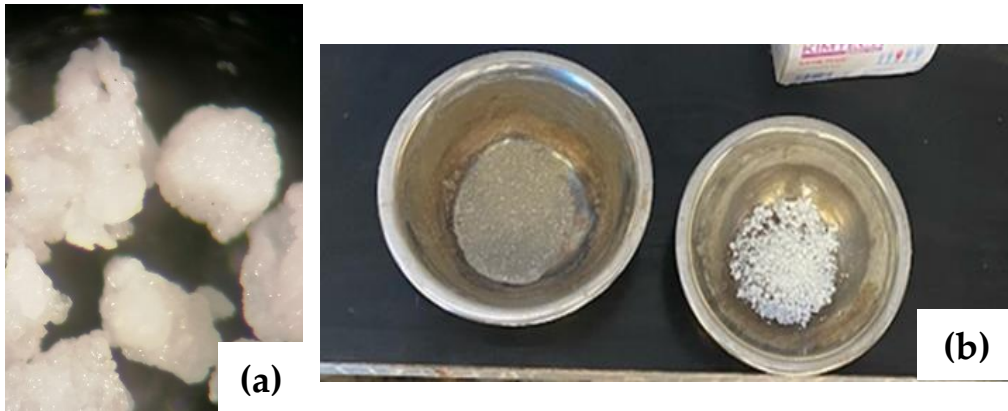
Figure 1. Appearance of: (a) TDI microcapsules (enlarged) and (b) crystalline hydrophilic additive (left) and TDI microcapsules (right)

The composition of TDI microcapsules is shown in Table 1. To prepare the microcapsules, 10 g of paraffin beads were weighed and then heated to 75 °C until complete melting. Further, 20 g of toluene diisocyanate (TDI) were added and the mixture was stirred with a mechanical stirrer for 3 h at a constant temperature of 75 °C and rotation speed of 600 rpm. Upon cessation of heating, 100 cm 3 of perfluorotributylamine (PFTBA) was added to the mixture, resulting in the formation of microcapsules which were isolated by vacuum filtration and dried at 40 °C for 24 h.