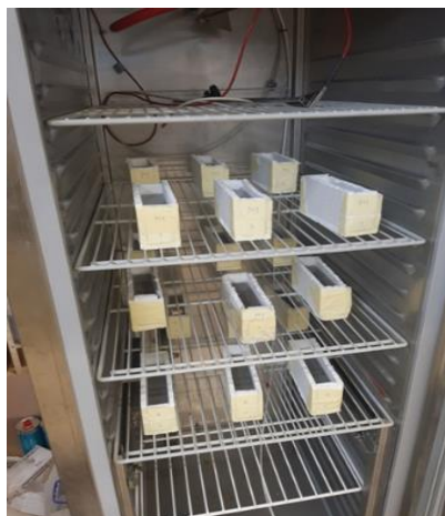
Figure 5. Mortar samples in the chamber