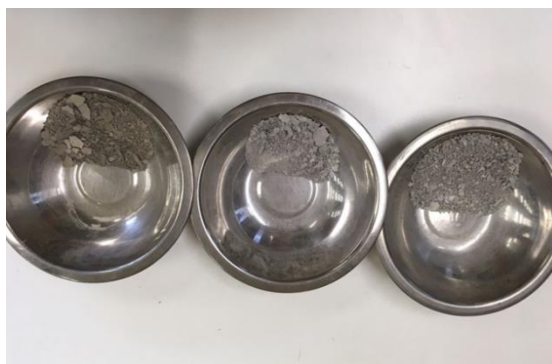
Figure 8. Total residues of scaling material of mortar mixture M2 (left), mortar mixture M1 (in the middle) and reference mortar mixture R (right)