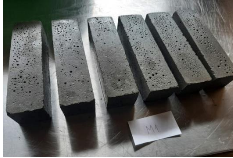
Figure 3. Samples of hardened mortar

After 28 days of curing in water, the prisms were placed in molds made of styrofoam and the edges around the upper surface of the mortar prisms and molds sealed with the sanitary silicone. A 3% solution of NaCl in distilled water