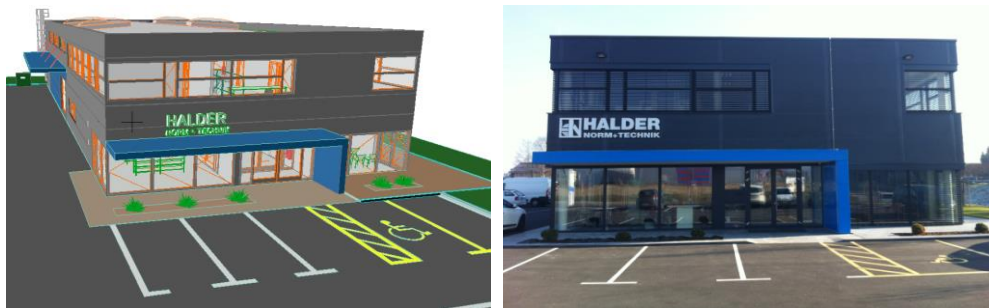
Figure 6 BIM model and completed business-storage facility in Hoče [60]

The final example of good BIM practice reviewed here was a 6D model applied to covering maintenance planning for a business-storage facility located in Hoče [59]. The developed 6D BIM was intended to be a service-book for the constructed object, including all required maintenance activities and related costs from the beginning of usage to the end of the projected lifecycle. The BIM model and completed business-storage facility are shown in Figure 6.