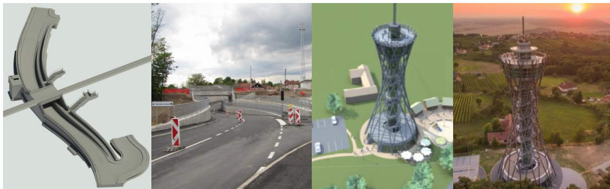
Figure 2 Grlava underpass (DEGRIP project) [46] and Vinarium Tower (jaBIM project) [47]

Mutual collaboration between universities and industry quickly revealed the requirement for an integrated BIM approach in construction operations. For instance, some early BIM-based projects such as DEGRIP [46] and jaBIM [47] were even supported by Slovenian Human Resources Development and Scholarship Fund, which acts within the European Social Fund framework. The outputs of the DEGRIP project provided 3D and 4D models for underpasses in Grlava and Ljutomer, whereas the implementation of the jaBIM project provided a BIM model for the Vinarium Tower in Lendava containing equal informational dimensions (see Figure 2).