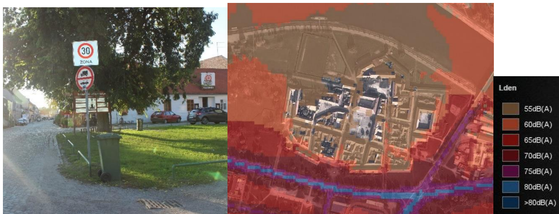
Figure 5 a) Noise abatement measures and b) noise levels in Tvrd̄a

Noise has been reduced in some parts of the city through other measures not focused on noise reduction, such as speed limits, traffic bans on certain types of vehicles, and suitable urban planning. For example: the streets in the old part of the city, Tvrd̄a, are paved with small stone cubes, which can generate considerable noise. Noise has been limited here through several measures introduced because of safety, pavement structure, and capacity. Some of the traffic areas, along with a central square, have been turned into pedestrian-only zones, while in other parts the car speed has been limited to 30 km/h and trucks and heavy vehicles have been prohibited (Figure 5, left). The high noise levels of European Avenue, located south of Tvrd̄a, have been attenuated by a green belt, but they have been reduced more so by the massive buildings around the perimeter. Figure 5 shows a noise map of the area, revealing the effect of these measures. It should be noted that these noise maps do not include noise from bars and clubs, though this noise can dominate on the weekends during the evening and night.