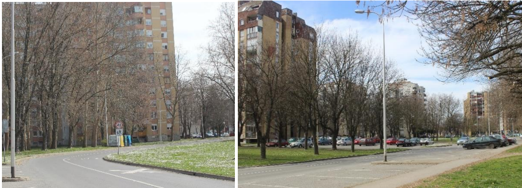
Figure 6 The settlement of Sjenjak