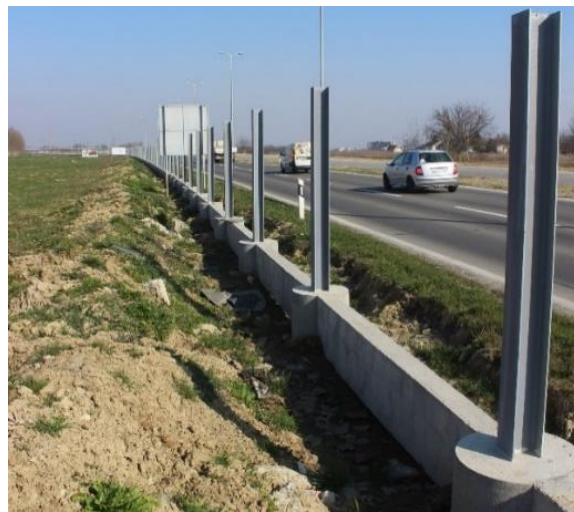
Figure 4 Noise barrier during construction

Noise has been reduced in some parts of the city through other measures not focused on noise reduction, such as speed limits, traffic bans on certain types of vehicles, and suitable urban planning. For example: the streets in the old part of the city, Tvrd̄a, are paved with small stone cubes, which can generate considerable noise. Noise has been limited here through several measures introduced because of safety, pavement structure, and capacity. Some of the traffic areas, along with a central square, have been turned into pedestrian-only zones, while in other parts the car speed has been limited to 30 km/h and trucks and heavy vehicles have been prohibited (Figure 5, left). The high noise levels of European Avenue, located south of Tvrd̄a, have been attenuated by a green belt, but they have been reduced more so by the massive buildings around the perimeter. Figure 5 shows a noise map of the area, revealing the effect of these measures. It should be noted that these noise maps do not include noise from bars and clubs, though this noise can dominate on the weekends during the evening and night.