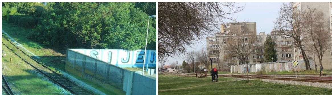
Figure 10 a) Existing barrier at railway station and b) areas along the railway where barriers are necessary

Noise near the railway station should be solved by planting vegetation and constructing barriers, which have already been constructed for safety reasons in one location (Figure 10, left). To further reduce noise, an absorbing surface could be applied to the existing barrier. Constructing barriers is especially convenient in areas where the rail passes close to residential areas. At the location shown in Figure 10 (right), as in many others, constructing barriers would be particularly appropriate because they would not only reduce noise but also improve safety by preventing uncontrolled crossing over the tracks.