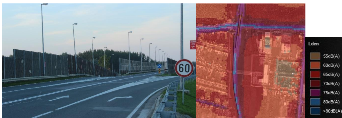
Figure 3 a) Noise barrier on west bypass and b) the effect of the noise barrier on noise levels

So far in Osijek, the only physical noise protection planned and built is on the western bypass at the junction with the Višnjevac suburbs (Figure 3, left): a noise barrier built from metal pillars with transparent and wooden panels. Transparent panels were used on the overpasses, and wooden panels were used in areas where the barrier rests on the embankment. On the eastern side, the barrier only covers the overpass because it is meant to protect the industrial/business zone; on the west side, next to the Višnjevac suburbs, the barrier is much longer because it protects the residential areas. Figure 3 shows this wall and its effect on the noise map.