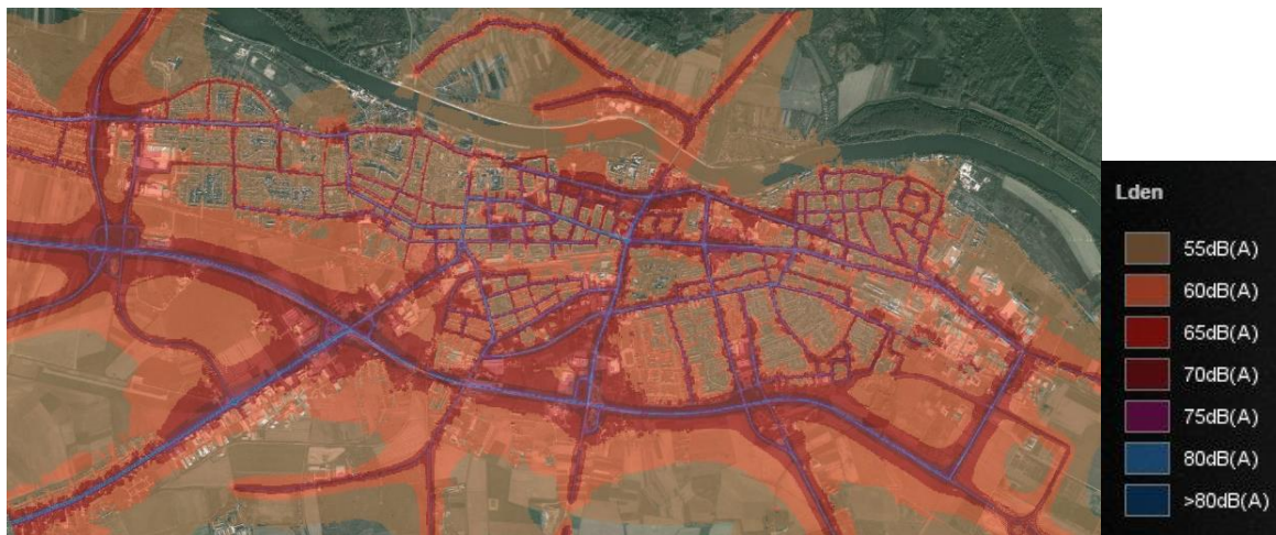
Figure 2 Daylong ( L_{den} ) noise levels from road traffic

Road transport with the longest traffic network affects the greatest number of people by the noise it produces. Noise levels shown through L_{den} exceed 55 dB in most residential areas, climbing to 70–80 dB in areas surrounding streets with high traffic volume (Figure 2). Even at night, noise levels are much higher than permissible: the larger city streets have noise levels as high as 65–70 dB. The streets with the most traffic noise are also the busiest city roads, which connect the city in longitudinal and transverse directions, linking areas on the verge of the city and the suburbs (Figure 2).