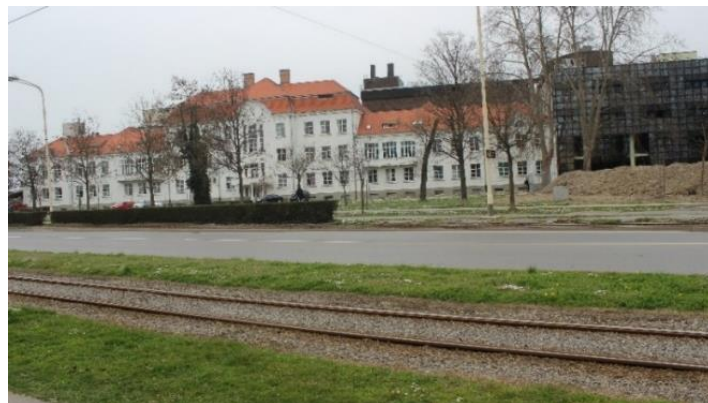
Figure 9 Area between campus and Osijek hospital

Along Cara Hadriana Street and European Avenue, near Osijek Clinical Hospital (Figure 9), the health care center, and the university buildings, noise levels could be reduced by choosing adequate trees and bushes of appropriate type. Extra peace and quiet near the hospital and campus could be obtained by constructing low barriers along the tram track, described in [16].