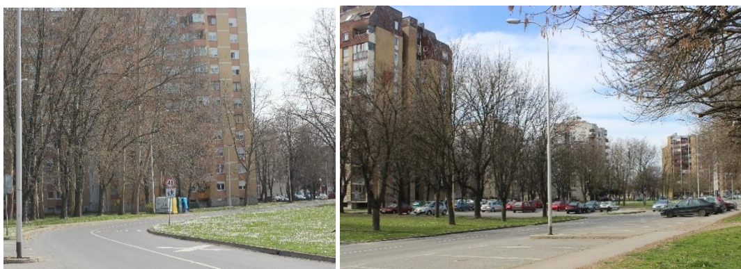
Figure 6 The settlement of Sjenjak