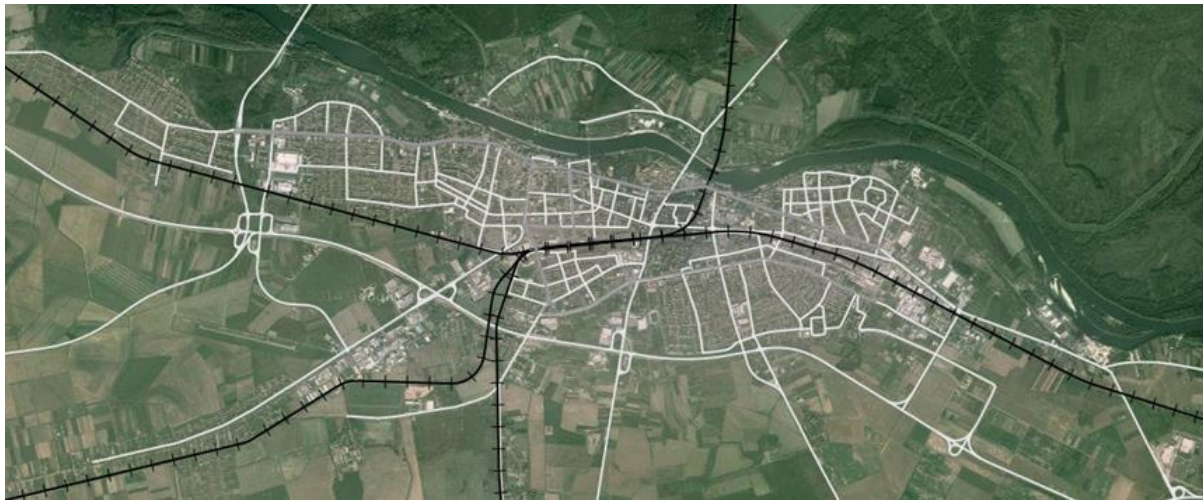
Figure 1 Traffic network of Osijek

Road transport with the longest traffic network affects the greatest number of people by the noise it produces. Noise levels shown through L_{den} exceed 55 dB in most residential areas, climbing to 70–80 dB in areas surrounding streets with high traffic volume (Figure 2). Even at night, noise levels are much higher than permissible: the larger city streets have noise levels as high as 65–70 dB. The streets with the most traffic noise are also the busiest city roads, which connect the city in longitudinal and transverse directions, linking areas on the verge of the city and the suburbs (Figure 2).